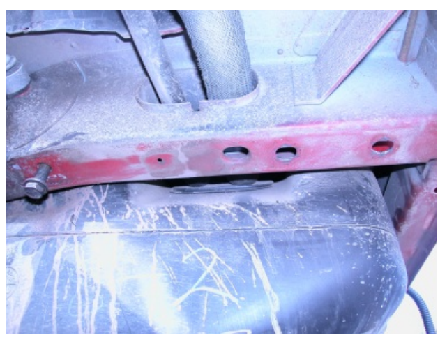
Driver Side View

4. Using the supplied small support bracket, attached to the outer wing of the bumper and install using the supplied 1/2" hardware to the open hole on either side of the vehicle (as shown).